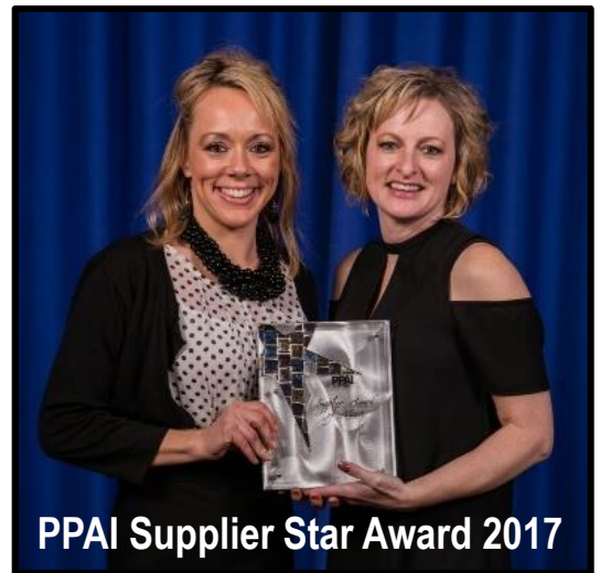
PPAI Supplier Star Award 2017